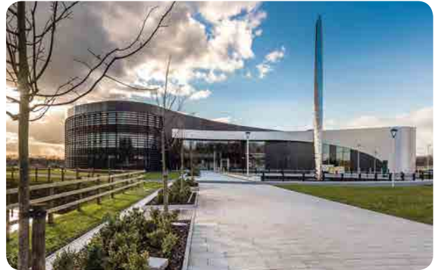
iHub in Derby: home to the new Nuclear AMRC Midlands.

In 2019, we are opening Nuclear AMRC Midlands at Infinity Park, Derby. We are launching R&D into controls